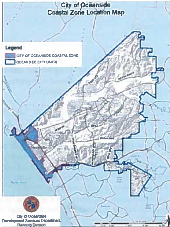
Figure 1: Oceanside Coastal Zone